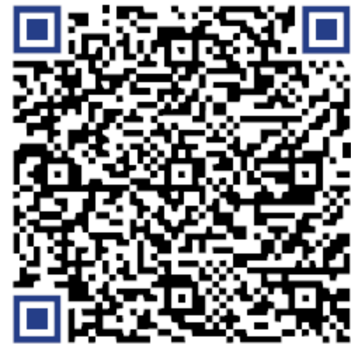
FT SAM HOUSTON